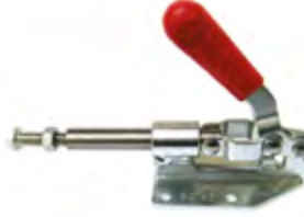
Medium-duty Lever [5/16" thread]