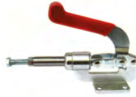
Heavy-duty Lever [3/8" thread]