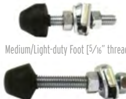
Medium/Light-duty Foot [5/16" thread]