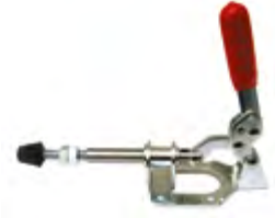
Light-duty Lever [5/16" thread]