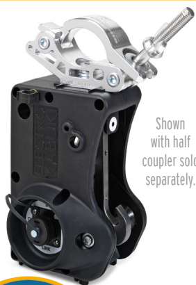
Shown with half coupler sold separately.