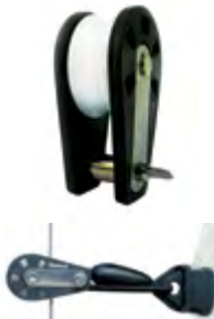
Showing the Wire Runner used with a Spaniflex and a Holdon.

Wire Runners Occasionally, it is preferable to use pulleys to run along tensioning wires to stretch out large cloths. These quiet smooth running pulleys have removable clevis pins so they can be inserted onto captive wires. The clevis pin can then either go directly through an eyelet in the cloth or be used with Holdons and Spaniflexes [page 183] to make a system which has the ability to adjust the cloth tension. The weight of the pulleys helps the cloth fly in. Great value.