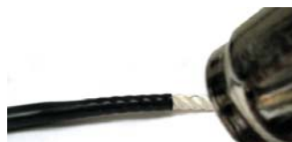
Using a heat gun to secure the heatshrink