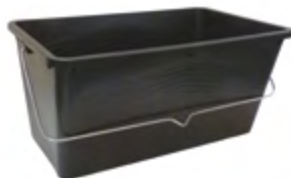
25 L Scuttle