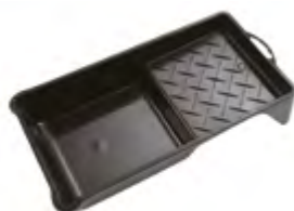
4" Economy Plastic Tray

Roller Trays and Scuttles A comprehensive selection of trays for every task. Now including the eco-friendly double award-winning cardboard roller tray which you can re-use without washing out. It is made entirely from recycled materials.