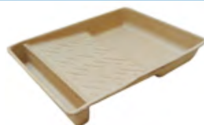
9" Cardboard Ezee Tray