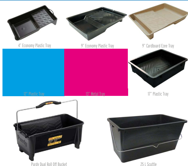
4" Economy Plastic Tray