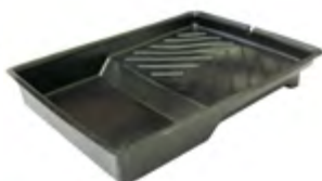
9" Economy Plastic Tray