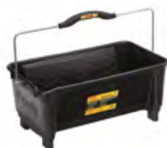
Purdy Dual Roll Off Bucket