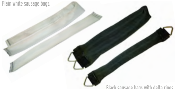
Black sausage bags with delta rings.