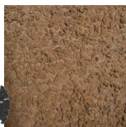
Rubber chips consolidated with Flexcoat tinted with Rosco Supersat.

Rubber Chips Ideal for creating onstage texture and foliage effects. Rubber chips are soft and quiet so they are a good choice of texture for opera scenery. They can be mixed with FR Binder [see next column] or added to Rosco Flexcoat or even Idenden Brushcote to create the desired effect. Great value. Black. 2mm-8mm [other colours available POA].