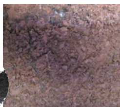
Foam Crumbs consolidated with Flexcoat tinted with Rosco Supersat.

Foam Crumbs Soft fire retardant [Class 0] foam crumbs widely used for creating soft textures. Excellent for hedge foliage and earth effects. Light in weight very soft under foot. They can be mixed with Flints Cyclorama Adhesive [page 1.77] FR Binder [see next column] or added to Rosco Flexcoat or even Idenden Brushcote to create the desired effect. Now in two crumb sizes.