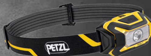
Aria 1 Blk/Yell 350 Lumens Headlamp