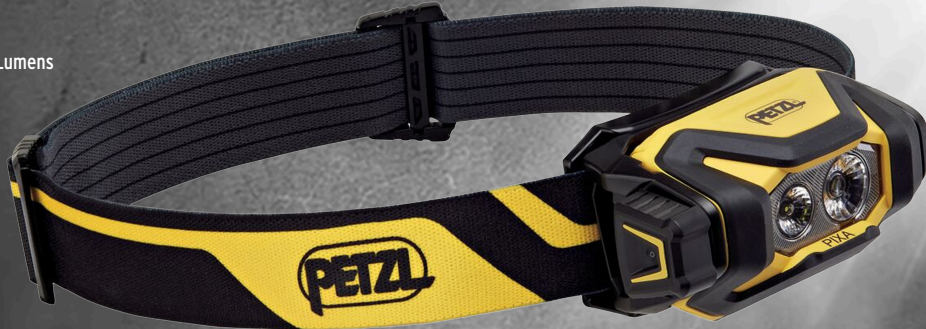
Pixa 450 Lumens Headlamp