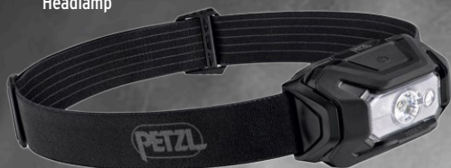
Aria 1 Black RGB 350 Lumens Headlamp

Essential kit for working backstage especially during lighting rehearsals. Frees up both hands allowing you to concentrate on the job and hang on to the ladder. The light source is close to your eyes ensuring the beam is thrown just where it is needed. Also handy for cycling home and outdoor pursuits. All our head torches are individually tested and have a three year guarantee.