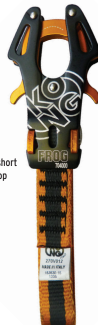
Frog with short web stop