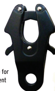
11m Ø hole for attachment