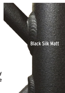
Black Silk Matt

Touch dry after 1 hour, Full cure in 6 hours. Coverage: approx 8 m 2 /L