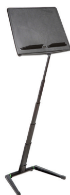
The Jazz Stand folds down and fits in the Gig Bag.