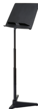
The unbreakable Alto Stand has no sharp corners.